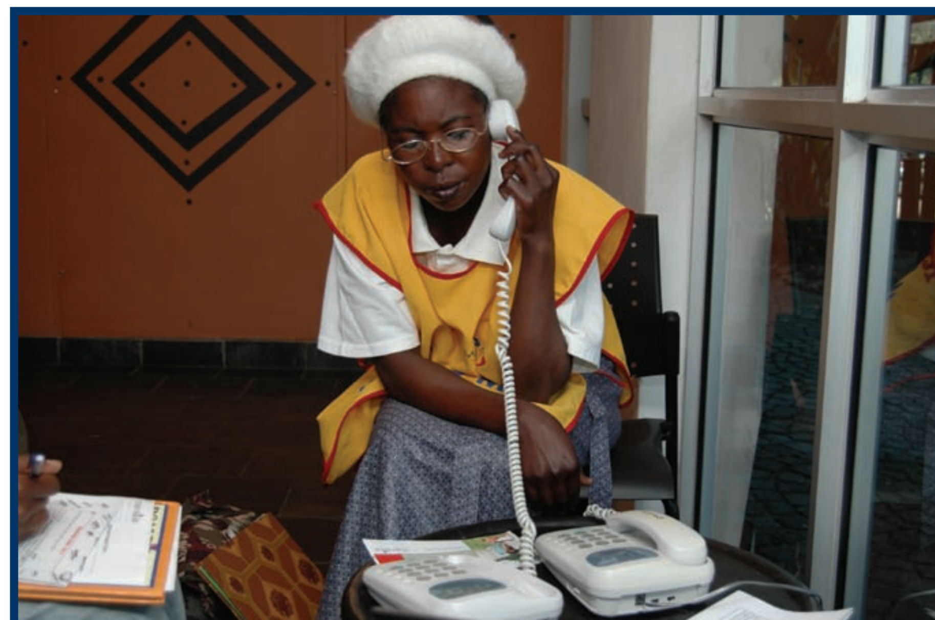
Figure 3: A user testing two automated telephone systems

A recorded voice was used instead of a synthetic voice; listening to and comprehending synthetic voices is more difficult, and a synthetic voice