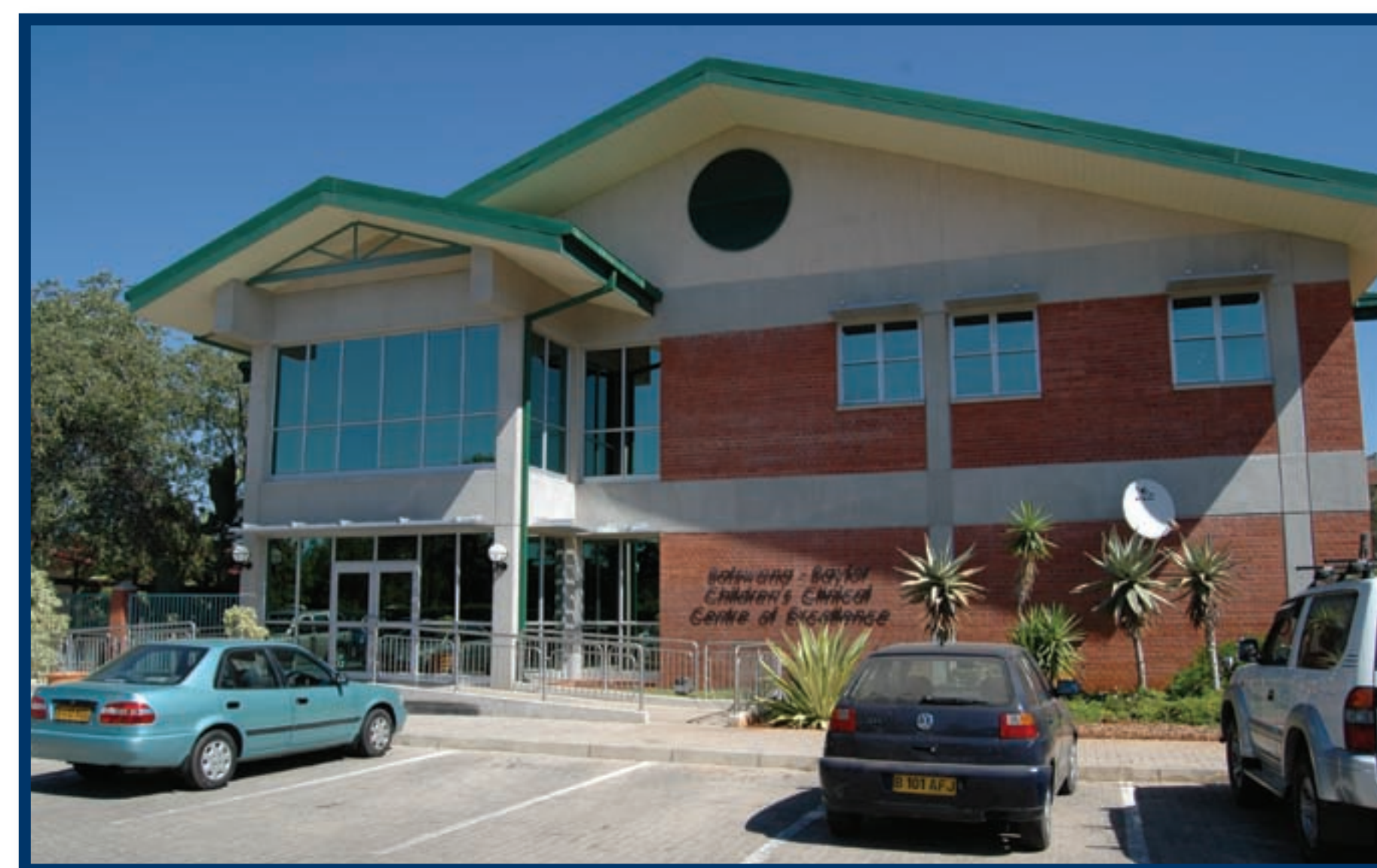
Figure 2: BBCCCoE in Gaborone

Items in each menu were listed and given to the user in their descending order of importance. During the user needs solicitation meeting, the caregivers were asked to prioritise the items that they wanted the system to address by their order of importance. The order of menu presentation reflects this prioritisation by the caregivers: the more important issues are mentioned first in the menu.